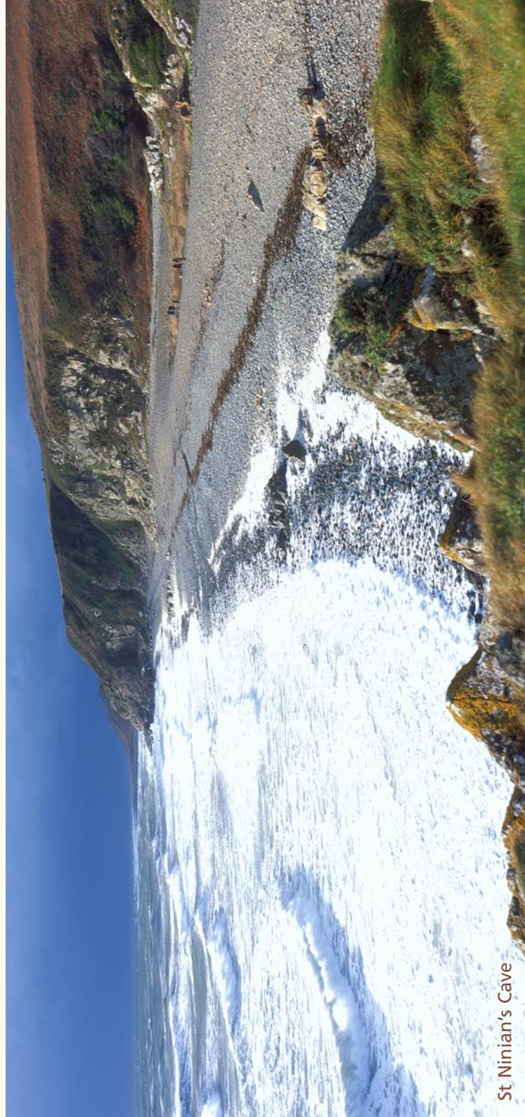
St Ninian's Cave

Fragments of two 'Whithorn School' crosses, and two cross-marked pebbles from St Ninian's Cave. Crosses from Craigmyle, Glasserton, Glenluce, and Mains of Penninghame, all local to Whithorn. Other early Christian carved stones from the region are also displayed, including stones from Drummore and Chapel Donnan. The remains of a metalwork processional cross from Dumfriesshire is also on display.