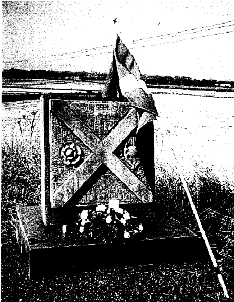
" THE BATTLE OF PINKIE CLEUGH "