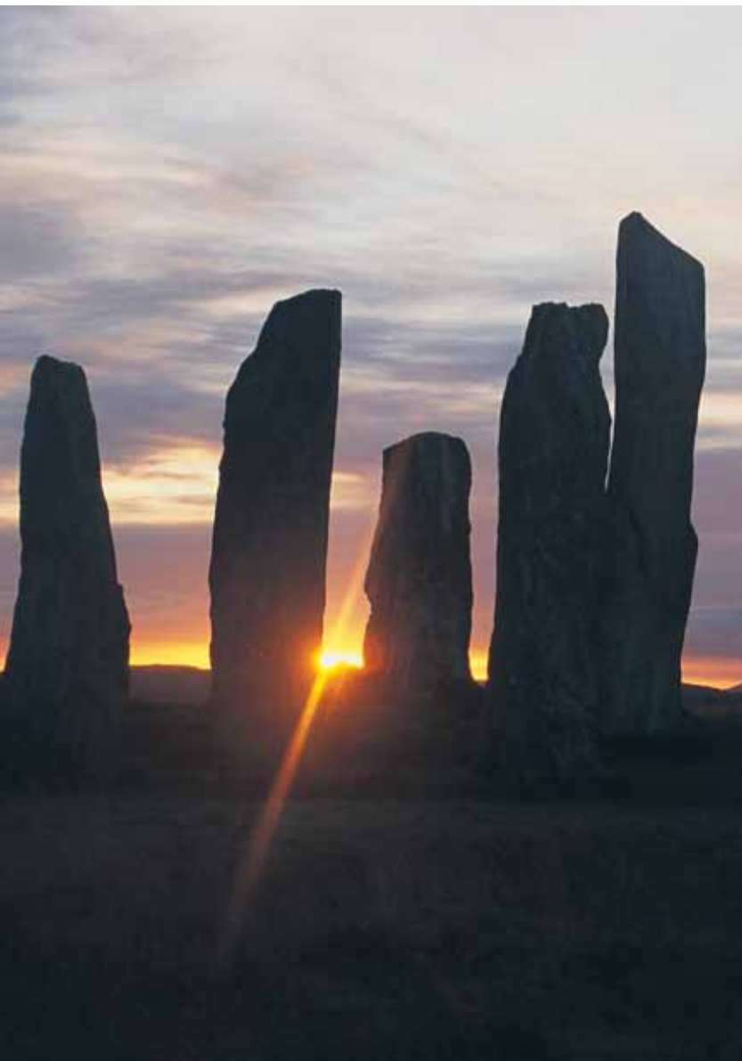
Callanish, in the Western Isles is a striking historic element of the modern landscape.