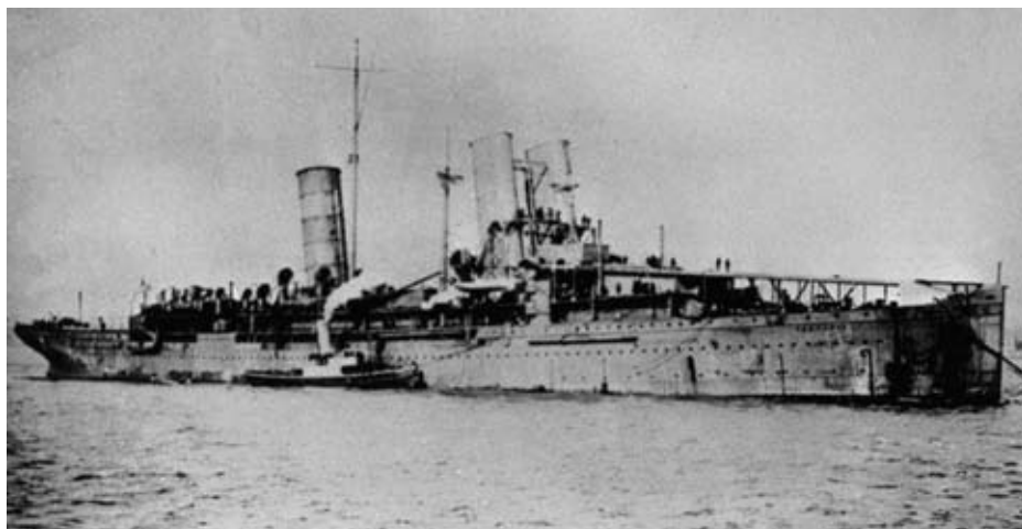
HMS Campania in 1917 - 000-000-586-769-C

of works which might have an affect on scheduled monuments. For more information on scheduling, see Historic Scotland's separate guide: Scheduled Monuments: a Guide for Owners, Occupiers and Managers .