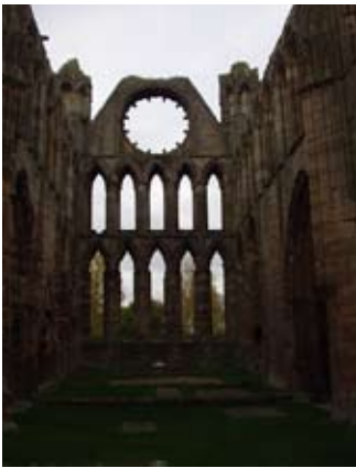
View into presbytery

The wooden screen was called a rood screen , from an old word meaning a cross. It had a painting of Christ on the cross on one side of it, with stars behind it. It would have reached high up to the ceiling. It was broken up in 1640 for firewood – by a Presbyterian minister!