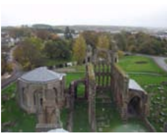
View east from tower