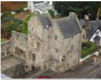
The 'Bishop's' house