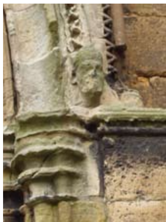
West entrance with bishop's head