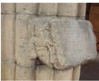
Lectern in chapter house