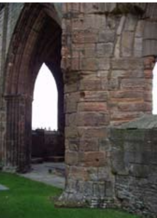
Site of bishop's throne