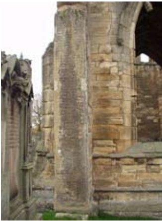
Scotland's tallest gravestone?

The lead from the roof and the cathedral bells were loaded onto a boat at Aberdeen and set sail for the Netherlands, where they were going to be sold. Unfortunately they were so heavy that the boat capsized.