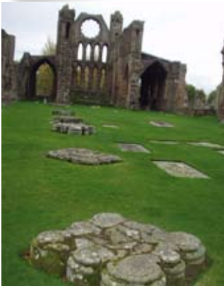
View east down nave, showing pillar stumps

Bishops today still wear similar clothing. They wear the pointed hat called a mitre and carry a stick like a shepherd's crook, called a crozier . This is because a bishop is meant to be guiding the people in the same way that a shepherd looks after his flock. A bishop also traditionally wears a special cross around his neck and a ring to show that he is 'married' to the Church.