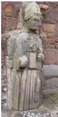
Statue of bishop