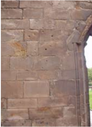
Bullet holes inside west entrance