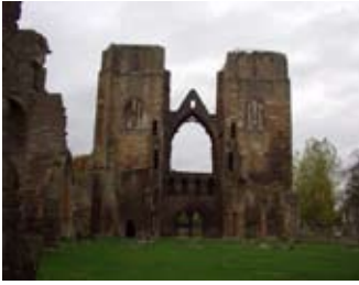
The west towers