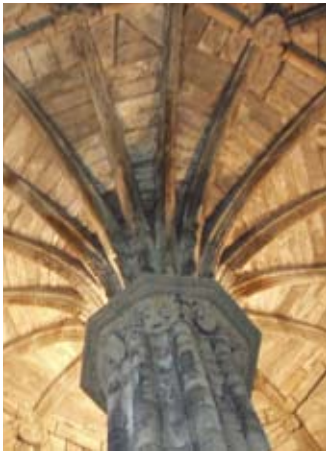
Central pillar in chapter house