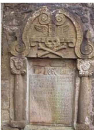
Grave of glove maker