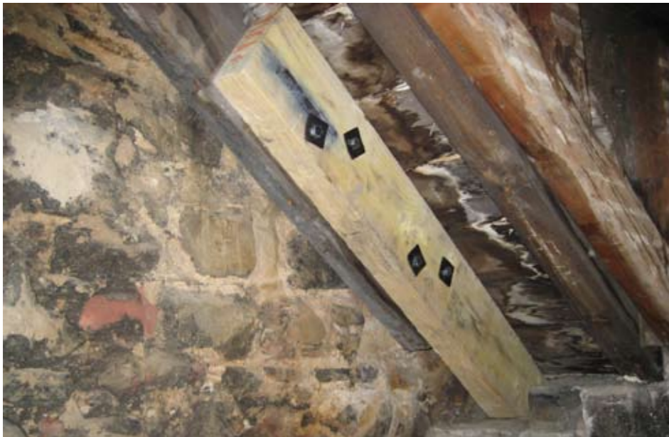
Strengthening of the joint with bolts

Sometimes, where wall repairs prevent the joists being located in the wall, joist hangers can be used, keeping timber away from a wall, which even after repair, may remain damp for several months.