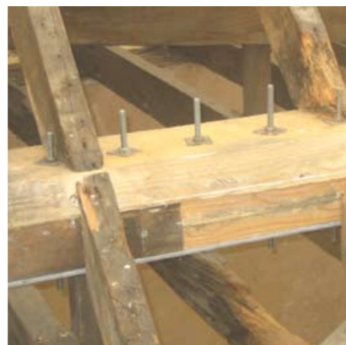
Composite repair using resin, new timber and steel plate

While some repairs may appear self evident, it should be remembered that as timberwork of such size is structural, a structural engineer with conservation experience may be required, especially on larger projects.