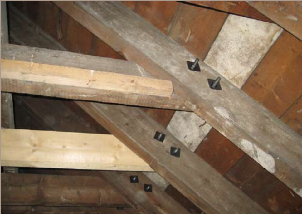
Strengthening of the joint with bolts

Structural joinery elements make up some of the key parts of a traditional building and their correct function is of crucial importance. Structural joinery refers to the timbers which form the roof and floor construction, and this INFORM will cover the survey, inspection and repair options and principles associated with work on these elements of a traditionally built property.