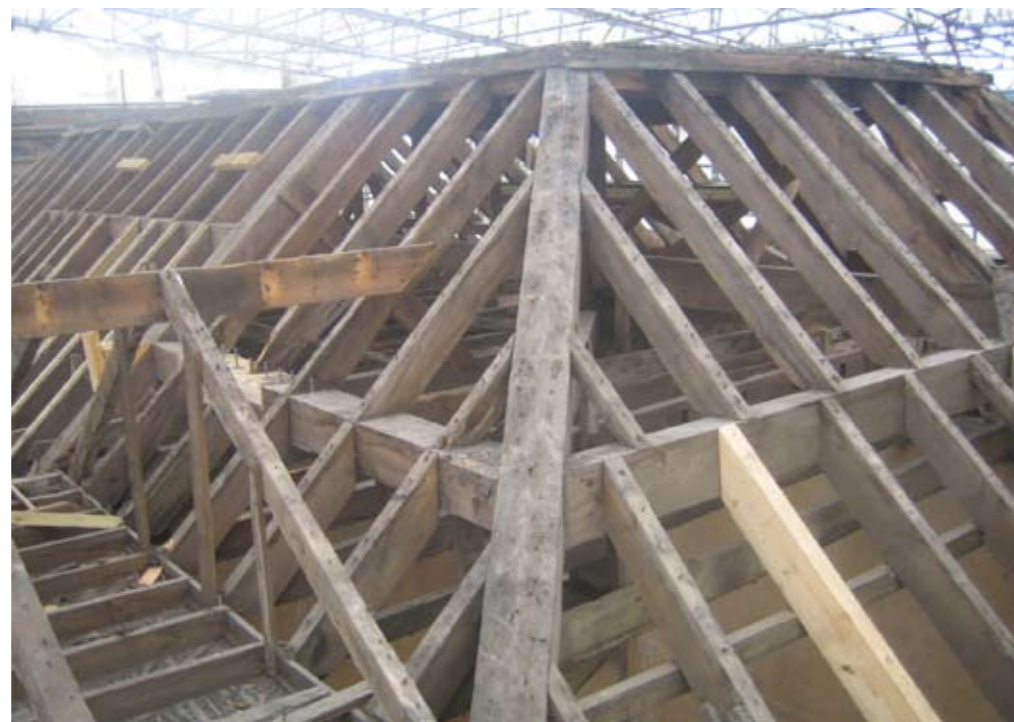
A roof of the Late 18th under repair, showing the purlins midway in the span.

In some earlier roofs, the A-frames are fewer, and joined longitudinally by timbers called purlins, shorter and smaller rafters then carry the roof. As the rafters have to carry more weight, they are referred to as principal rafters. This type of roof became rare by the 19th C, and standard A frame