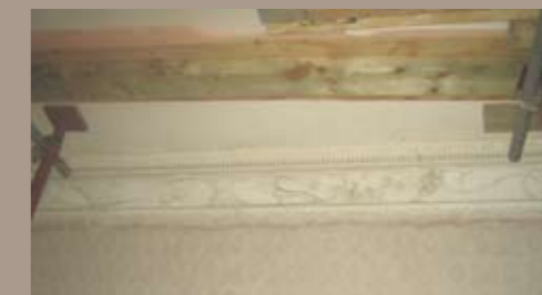
Supporting a ceiling during work on the joist ends

Due to the orientation of roofs, decay tends to be more pronounced on the Northern pitch of a roof, as there is less warming and drying by the sun, with timber consequently at a lower temperature – and water, from condensation or leaks, tends to linger longer. In such cases, the timber is decayed by various types of rot, and the element settles, distorting the structure and leading to further ingress. Eventually failure is total and substantial parts of the roof are affected.