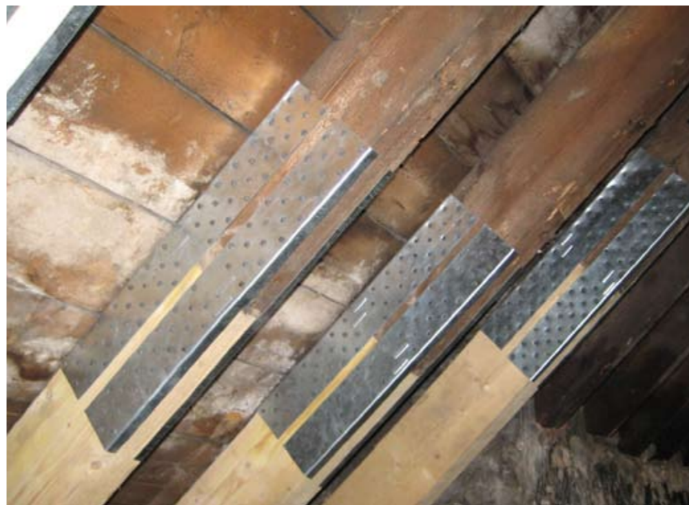
Modern metal pre drilled straps used in rafter splices.

Most rooms had fireplaces, and a special arrangement was required to carry the projecting hearthstone without having joists terminating under the hearth. In this case a “trimmer beam” was fitted at right angles to the joists, parallel to the line of the hearth. Deafening boards were fitted and packed with cinders or clinker, and the hearthstone laid on top. The floorboards were then laid flush with the hearthstone. A raised hearth stone is modern practice.