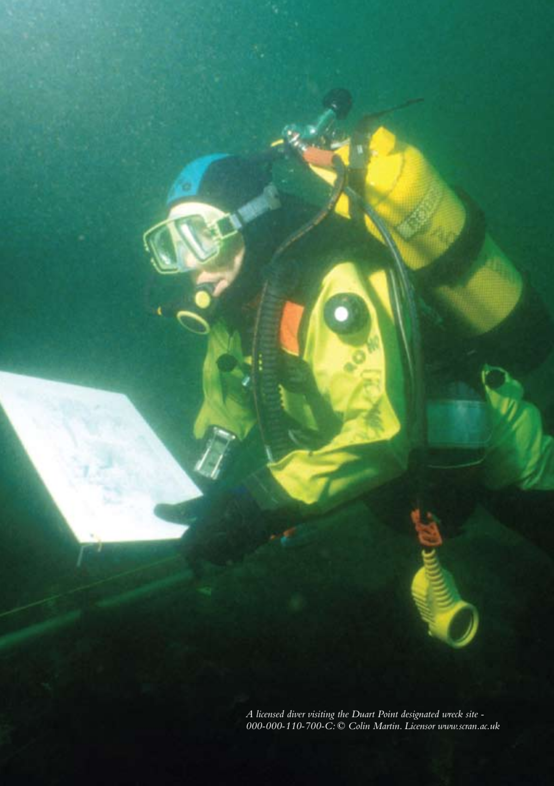
A licensed diver visiting the Duart Point designated wreck site - 000-000-110-700-C