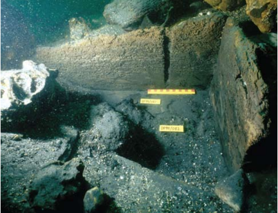
Remains of a seaman's chest from the Duart Point wreck -000-000-110-645