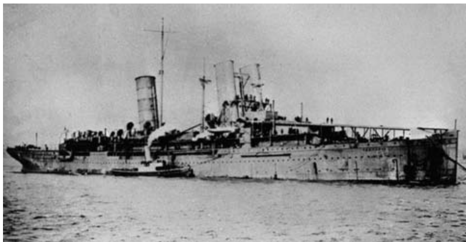
HMS Campania in 1917

of works which might have an affect on scheduled monuments. For more information on scheduling, see Historic Scotland's separate guide: Scheduled Monuments: a Guide for Owners, Occupiers and Managers .