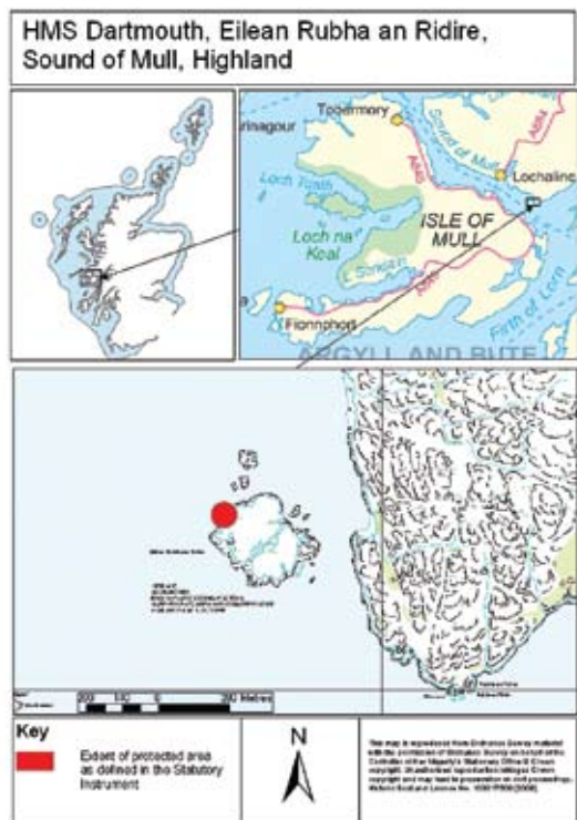
A site description map showing the location of the designated wreck of HMS Dartmouth and the extent of the protected area

Admiralty Charts show information about designated wreck sites for sea users.