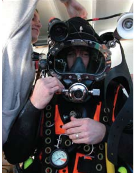
A diver from the UK-wide archaeology services contract

A pan-UK contract for archaeological services in support of the 1973 Act provides Historic Scotland with advice and archaeological assessment to inform designation and to facilitate the management and understanding of existing designated wreck sites.