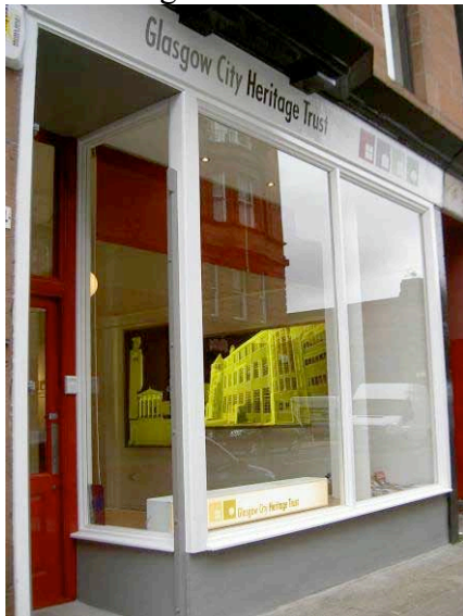
Glasgow City Heritage Trust offices with window displays

This is also very important. Glasgow City Heritage Trust have new offices with displays behind the glass.