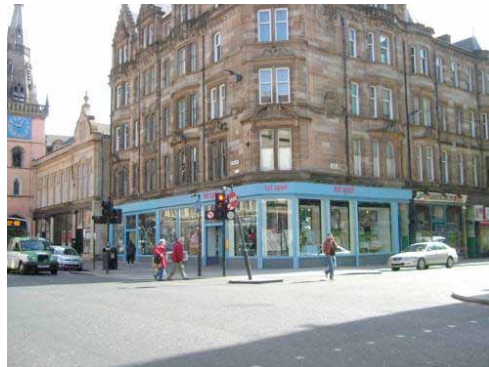
Corner of King Street

On the corner of King Street there was a tenement with ground floor shops overlaid in aluminium with dropped fascias. The THI worked with the owner to unpick it and put back what was there with a high fascia and low stallriser. The wide bands behind hide down-pipes from the bathrooms and other plumbing installed in more recent times in the City Improvement Trust tenements above. These were boxed out in an ugly fashion which all has to be worked with but the improvements now make for a very respectable block.