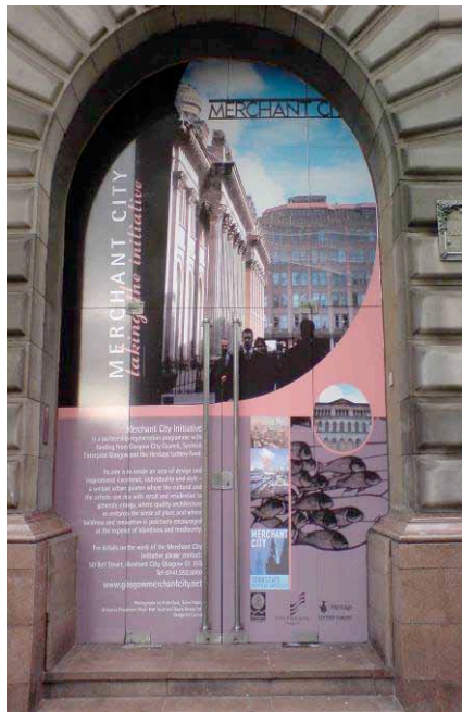
Art work in a vacant bank building, Trongate

For example, the Selfridges Site where we have put in small bits of art work which is really a sticking plaster on a wound although it improves the street scene temporarily.