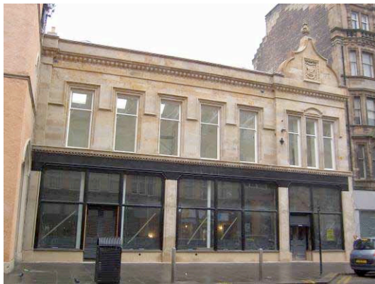
Tron Steeple project

The second project was at the Tron steeple which was formerly a city improvement scheme. Both shops there had gone out of business and the shops above used for storage. Instead of re-letting the City Council agreed to work with the THI and placed the building with the Glasgow Building Preservation Trust. They unpicked the shopfronts and tried to get back to the original frontage. The new shops were occupied by a special needs arts group on the ground floor which is a very good use and there is a fabulous upper floor space.