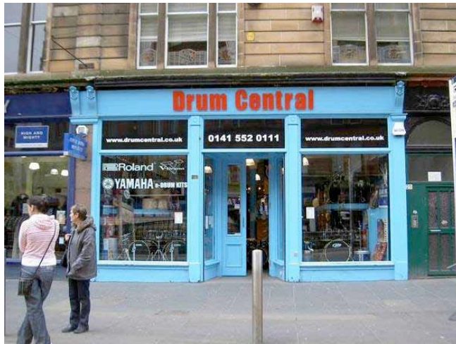
Drum Central with renovated shopfront

but the Council agreed to work with the THI to let these refurbished spaces not just on the basis of the highest tendered rent but also on the basis of the robustness of the business, its fit with the arts, culture and design ethos of the area and also on the contribution that business would make to the Merchant City as a whole; this allowed small indigenous business to become established by offering the unit at low rents or rent free. 90% of these businesses have survived.