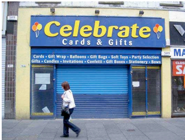
Typical modernised shopfront

Glasgow has lost so much of its historic fabric. The Merchant City THI is trying to not just restore shopfronts but it is about bringing back confidence, pride and style and the tradition and quality which the area once had. However, in the City it is not easy to unpick more recent alterations and find a lovely cast iron shopfront behind as things were often completely swept away. During the 1960's and 1970's there was a resort to quick fixes and in some ways that has been the city's wonder but it is also its undoing. This has resulted in a loss of almost all of the historic fabric and it is not just a surface gloss.