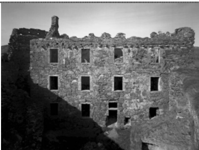
Fig. 158 Mingary Castle, Ardnamurchan: