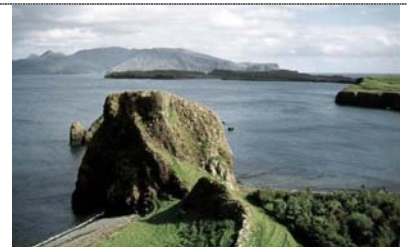
Fig. 190 = Fig. 41 Coroghan Castle, Canna: general view from ...