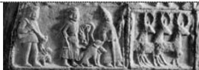
Fig. 181 Alexander MacLeod tomb, Rodel Church, Harris: detail of hunting scene