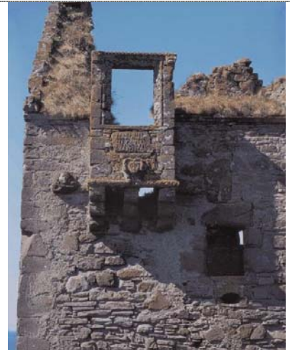
Fig. 157 Gylen Castle, Kerrera, Argyll: