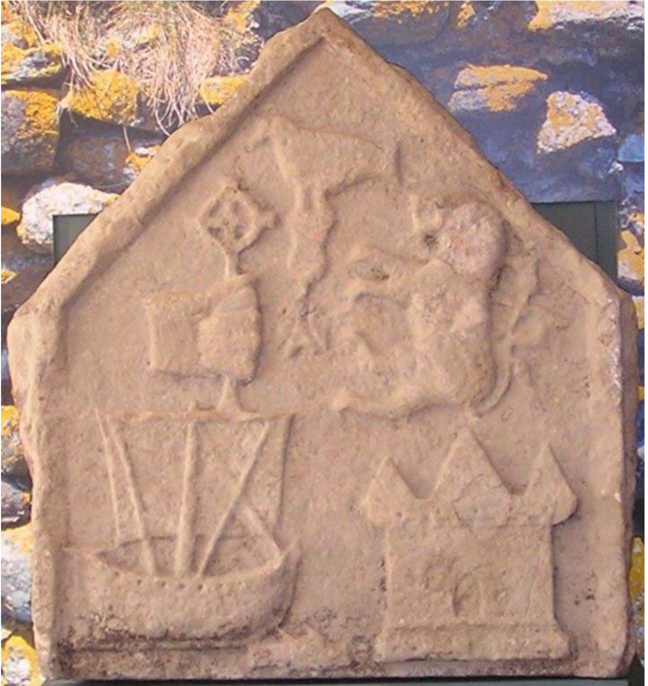
Fig. 191: Clach Chlann 'Ic Ailean (The Clanranald Stone), Kildonan Museum, South Uist (Geoffrey Stell, 11 May 2006)