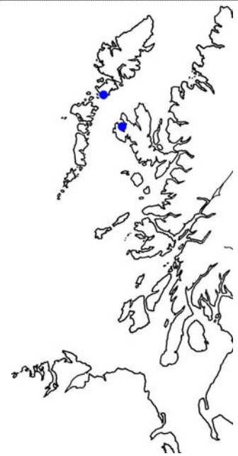
Fig. 162 Map showing Dunvegan and Rodel