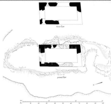
Fig. 155 Fincham Castle, Argyll: RCAHMS plans published 1992