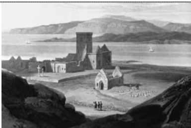
Fig. 163 Iona Abbey, Argyll: view by William Daniell (...)