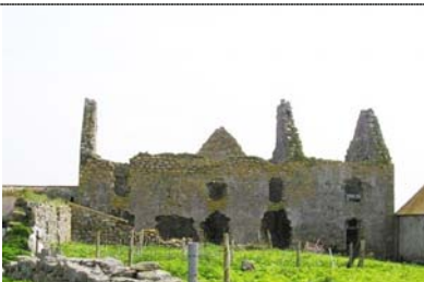
Fig. 188 = Fig. 138 Ormiclate, South Uist: principal or ... elevation