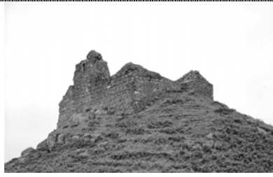
Fig. 168 Ardtornish Castle, Morvern: general view from ...