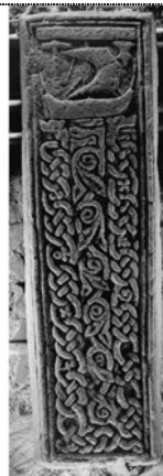
Fig. 164 Speciman late medieval graveslab of the Oronsay 'school' of monumental sculpture