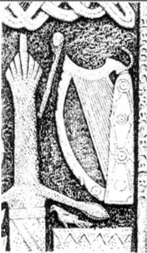
Fig. 177 Keills Chapel, Argyll: detail of drawing of graveslab by ... (date)