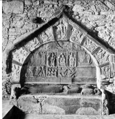
Fig. 161 Rodel Church, Harris: Alexander MacLeod tomb (1528)