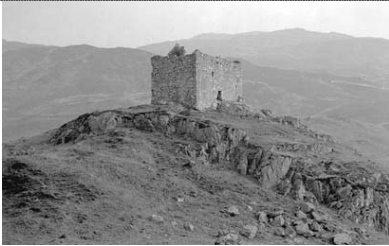
Fig. 152 Glensanda Castle, Morvern: general view from south

been the subject of surveys, Tioram was part of a small and very select group. Furthermore, the fact that the evidence for actual government use remains in doubt is reason for ensuring that the building fabric remains capable of being sensitively 're-read'.