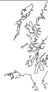
Fig. 172 Map showing distribution of properties associated with MacDonald of Sleat [TO BE COMPLETED]