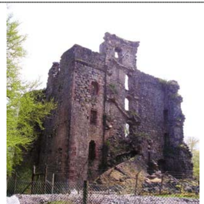
Fig. 159 Invergarry Castle, Inverness-shire: general view from ... showing collapsed stair turret