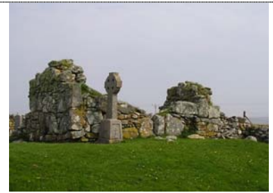
Fig. 187 = Fig. 124 Howmore South Uist: general view from ...