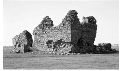
Fig. 184 = Fig. 128 Borve Castle, Benbecula: general view from ...