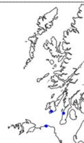
Fig. 175 Map showing possessions of MacDonalds of Dunivaig, Barr (Kintyre) and The Glens (County Antrim)