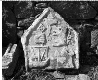
Fig. 186 = Fig. 126 Howmore South Uist: the 'Clanranald Stone'