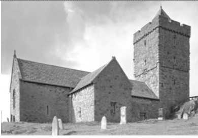
Fig. 160 Rodel Church, Harris: general view from ...