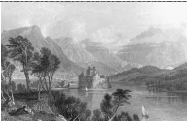
Fig. 180 Kilchurn Castle, Argyll: