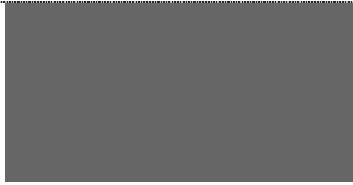
Fig. 171 Dun Sgathaich, Skye: general view from ...