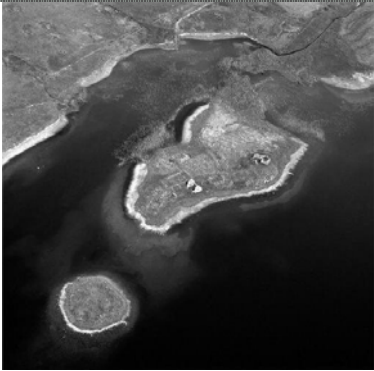
Fig. 167 Finlaggan Castle, Islay, Argyll: aerial view from ...