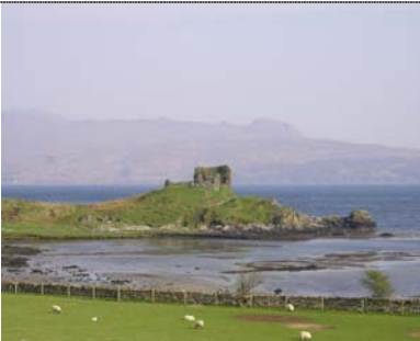
Fig. 170 Knock or Camus Castle, Skye: general view from ...