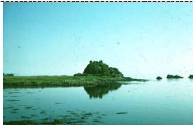
Fig. 174 Dunivaig Castle, Islay, Argyll: general view from ...