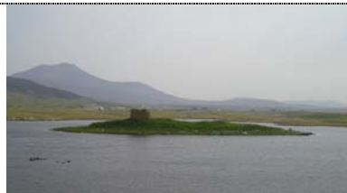
Fig. 189 = Fig. 134 Caisteal Bheagram, Loch an Eilean, South Uist: general view from ...