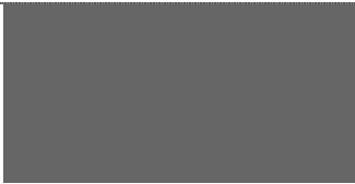
Fig. 185 = Fig. 119 Eilean Fhianain, Loch Shiel: