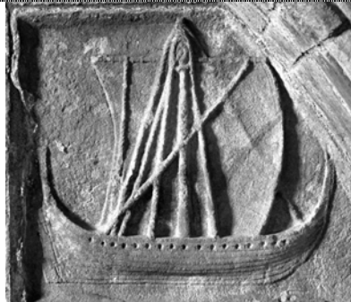
Fig. 178 Alexander MacLeod tomb, Rodel Church, Harris: detail of carved galley