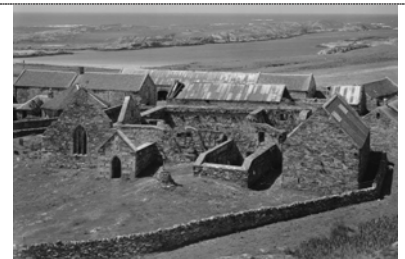
Fig. 165 Oronsay Priory, Argyll: general view from ...