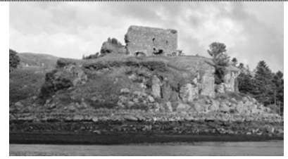
Fig. 169 Aros Castle, Mull, Argyll: general view from ...