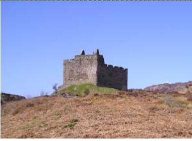
Fig. 183 = Fig. 103 Castle Tioram: general view from south